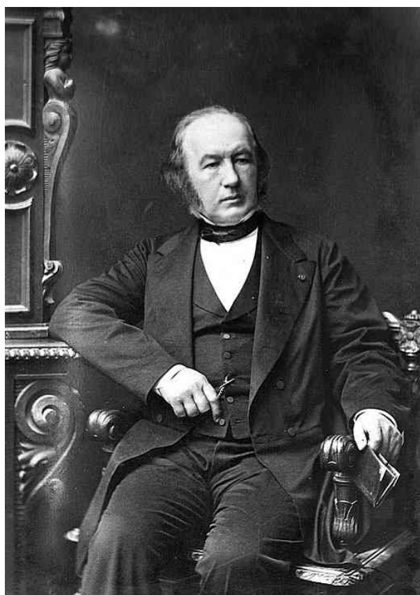
Figure 2. Claude Bernard (1813-1878) was the one who could clearly understand that medicine is a "technique", clinical research a technology, and physiology is the science behind both.

The impossibility of separating the nomenclature of a science from the science itself, is owing to this, that every branch of physical science must consist of three things; the series of facts which are the objects of the science, the ideas which represent these facts, and the words by which these ideas are expressed. Like three impressions of the same seal, the word ought to produce the idea, and the idea to be a picture of the fact. And, as ideas are preserved and communicated by means of words, it necessarily follows that we cannot improve the language of any science without at the same time improving the science itself; neither can we, on the other hand, improve a science, without improving the language or nomenclature which belongs to it. However certain the facts of any science may be, and, however just the ideas we may have formed of these facts, we can only communicate false impressions to others, while we want words