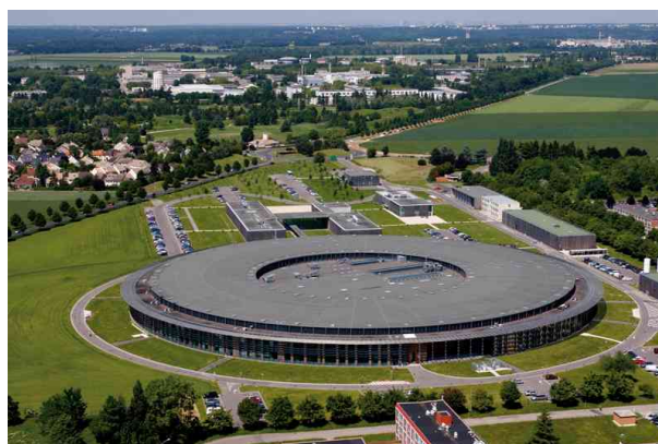
Figure 3. With a complex system such as a synchrotron (here the Soleil Synchrotron, in Saint-Aubin, France), characterizations can be done: this is a technical activity. The results of the measurements can be used for technology or for science.

The second article in the journal, Exploring the impacts of postharvest processing on the aroma formation of coffee beans , is again a review, and its title seems to clearly announce that it is about exploring a technical field. However, as written before, technical facts can be the basis of technological or scientific studies, so that the title is not sufficient to decide what activity this article is about. Observing which odorant compounds are produced through postharvest processing would be only observing a phenomenon, and this is different from understanding the mechanisms by which these odorants compounds are produced, or detecting a new odorant compound. In this big review, the authors describe the technique of coffee cultivation and processing, and using mainly published material they give the list of the odorant compounds at different steps of processing. They claim in particular that “the volatile constituents of green coffee beans have no significant influence on the final coffee aroma composition, as only a few such compounds remain in the beans after roasting”, and they observe that much information is needed to better “influence the quality of the final coffee beverage”.