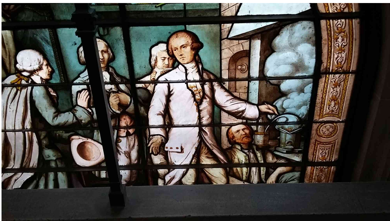
Figure 1. After alchemy gave birth to “chymie”, Antoine Laurent de Lavoisier (1743-1794) finished making chemistry a science of nature. He clearly made the difference between science and technology, in particular during studies of meat stock.

of the fields of science, technology, engineering and technique. The nature and methodology of sciences of nature is discussed, before analysing the first articles of an issue of the journal Food Chemistry , whose title would indicate that it is a journal of food science, but that considers also the effects of processing (Food Chemistry, 2024).